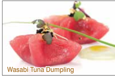
Wasabi Tuna Dumpling