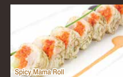
Spicy Mama Roll