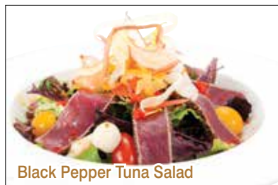
Black Pepper Tuna Salad