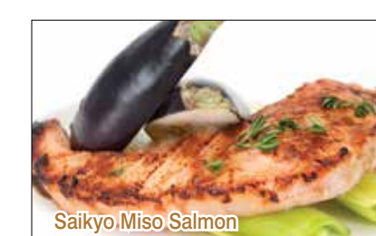
Saikyo Miso Salmon