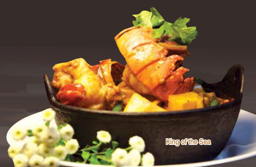
King of the Sea