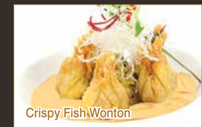
Crispy Fish Wonton