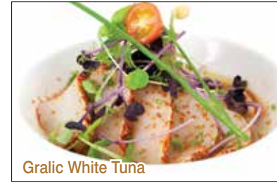
Gralic White Tuna