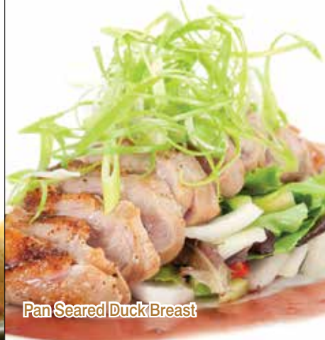
Pan Seared Duck Breast