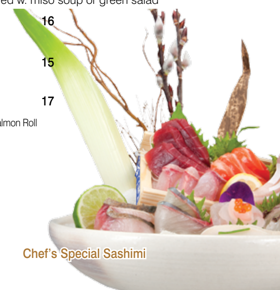
Chef's Special Sashimi