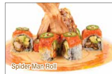
Spider Man Roll