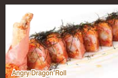
Angry Dragon Roll