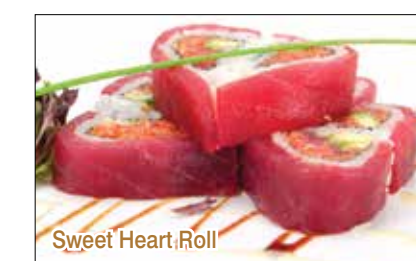
Sweet Heart Roll