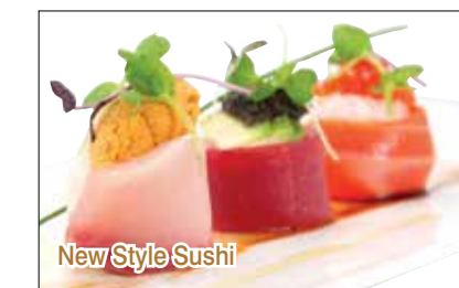
New Style Sushi