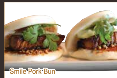
Smile Pork Bun