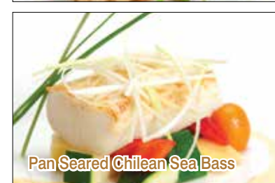
Pan Seared Chilean Sea Bass